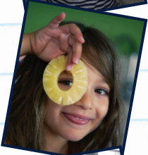
Funny face photo - Strike a funny pose!