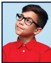
Brady Bunch style - Have some kids looking left, right, up & down.