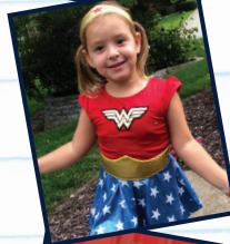
Super Hero Day – Ask students to dress up as their favorite super hero and take a selfie.