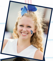
School Pride Day Pics – Have the school pose wearing school colors.