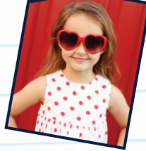
Favorite color – have each child dress head to toe in their favorite color.