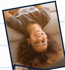
A New Angle - Have students pose at a fun angle, sideways or upside down.