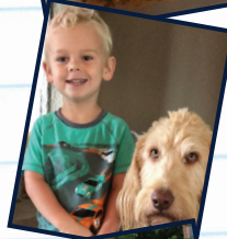
Portrait with your pet – Have kids take a photo with their pet or stuffed animal.