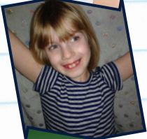
Love my blanket - Use a nice sheet or blanket as an instant backdrop.