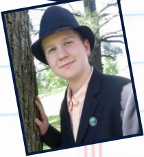
Crazy Hat Snap – Have kids make or find a crazy hat and snap a photo.