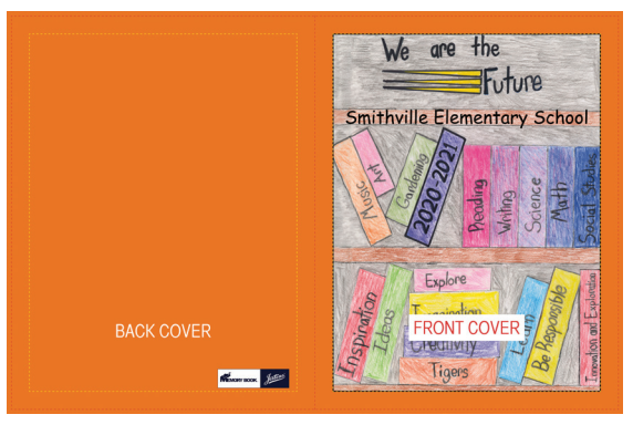
Image placed in image area and a solid color background added. The image has to be placed inside the image area because text is less than 1/2" from edge.